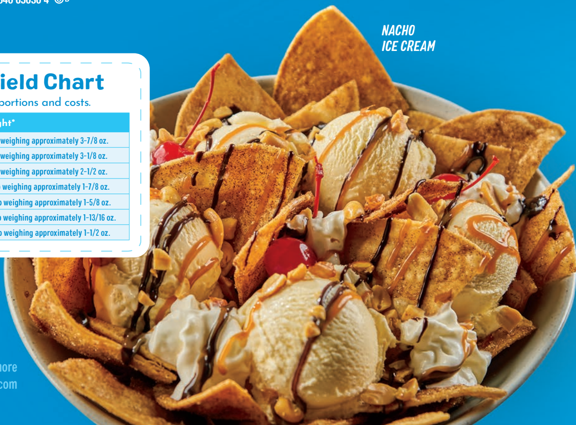
NACHO ICE CREAM

1-3 gal. Item #19533 UPC 0 70640 05006 2 GTIN 1 00 70640 05006 9