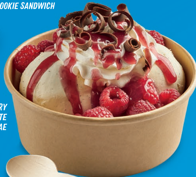
RASPBERRY DARK CHOCOLATE SUNDAE

Find these recipes & more at wellsfoodservice.com