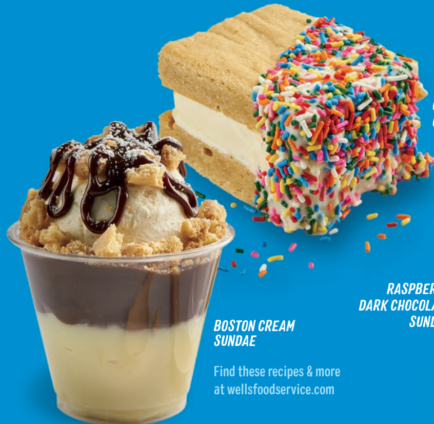
BOSTON CREAM SUNDAE

Not labeled for individual sale. GTIN 1 00 70640 31150 4 ©