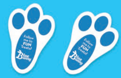
DIGITAL AD ASSETS